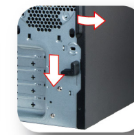
Side cover latch