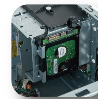
Tool-less 2.5" HDD holder