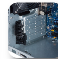
Tool-less design on PCI card holder