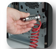
Support 120 mm front & rear fans